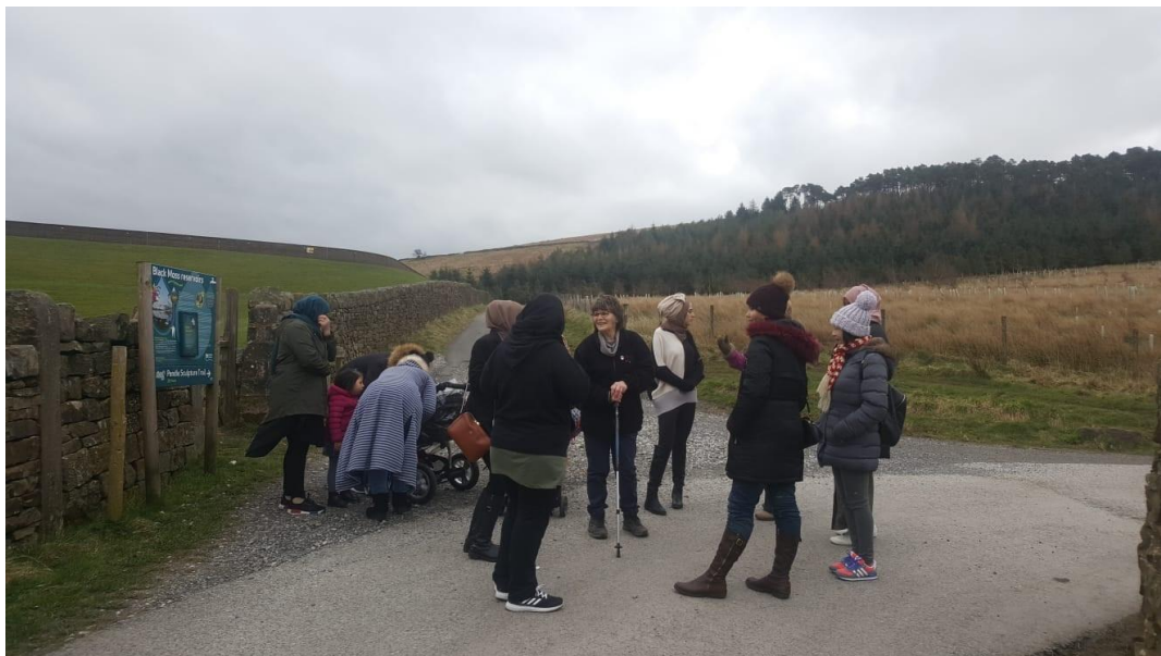
ZK Arts – Rise Up project visiting the Pendle hill area for artistic inspiration

We have started to think about plans for Year 2 and the Fund will re-open for applications on 18 th August. Panel members were re-appointed at the end of June, with the addition of two new members.