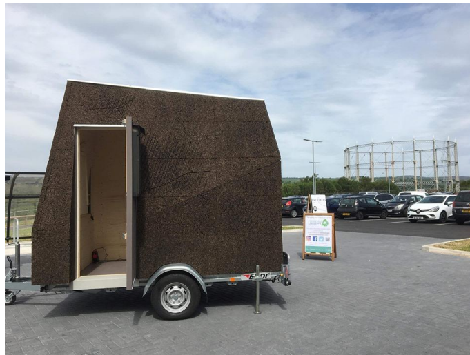
Talkaoke session at the Gathering Event, and the new Pendle Hill Mobile Hut

Attendees were also invited to contribute to the Pendle Hill Memory Map: What the Hill Heard by providing an anecdote, fact, memory or drawing that Pendle Hill has witnessed.