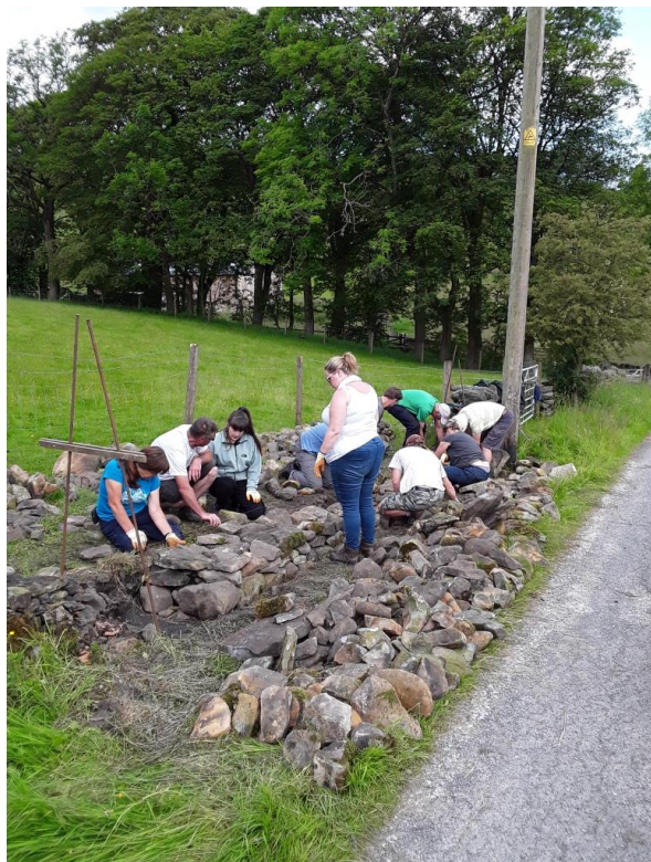
Beginners walling course set to work (left) ...and show off their completed wall (below)