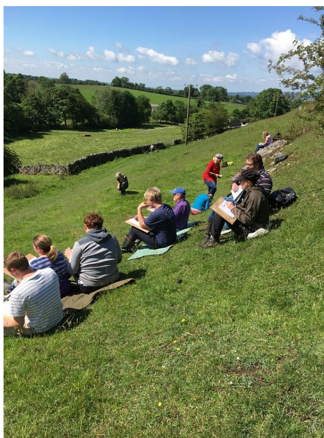
Artists and botanists at Worsaw Hill