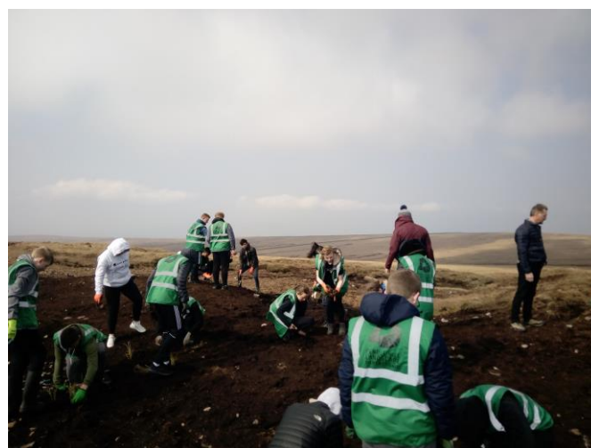
Lancashire Police Cadets getting into volunteering