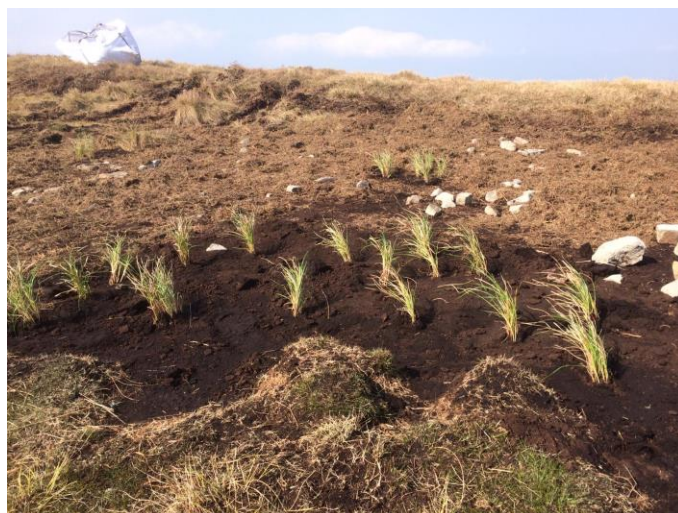
Staff and volunteers carry plants up the hill, ready for planting into the bare peat at the Engagement Day