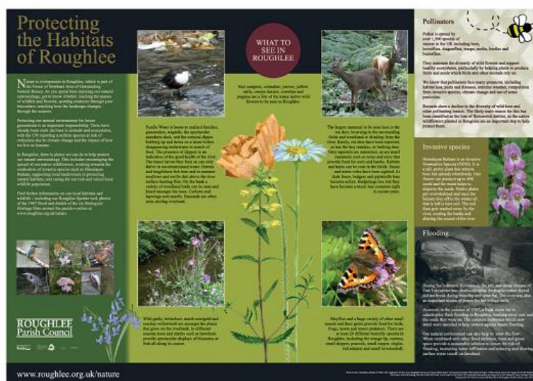
Roughlee Habitat project – new interpretation board