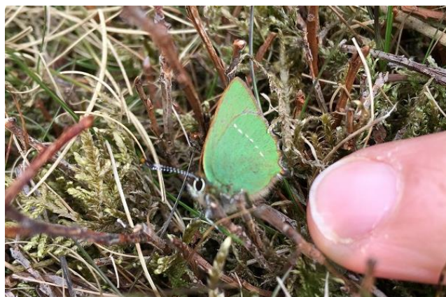
Green Hairstreak butterfly on Pendle, 2 May 2019