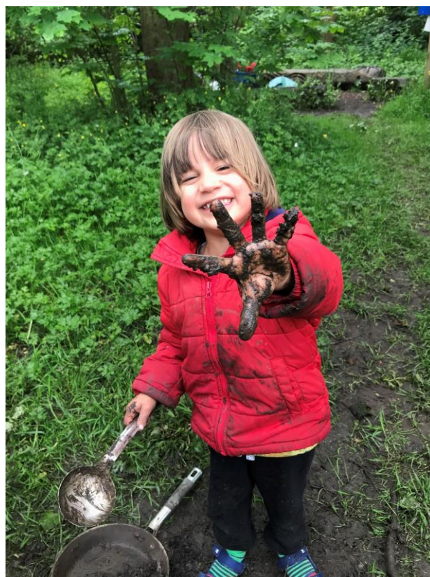
Little Saplings activities: Dad den building and mud kitchen