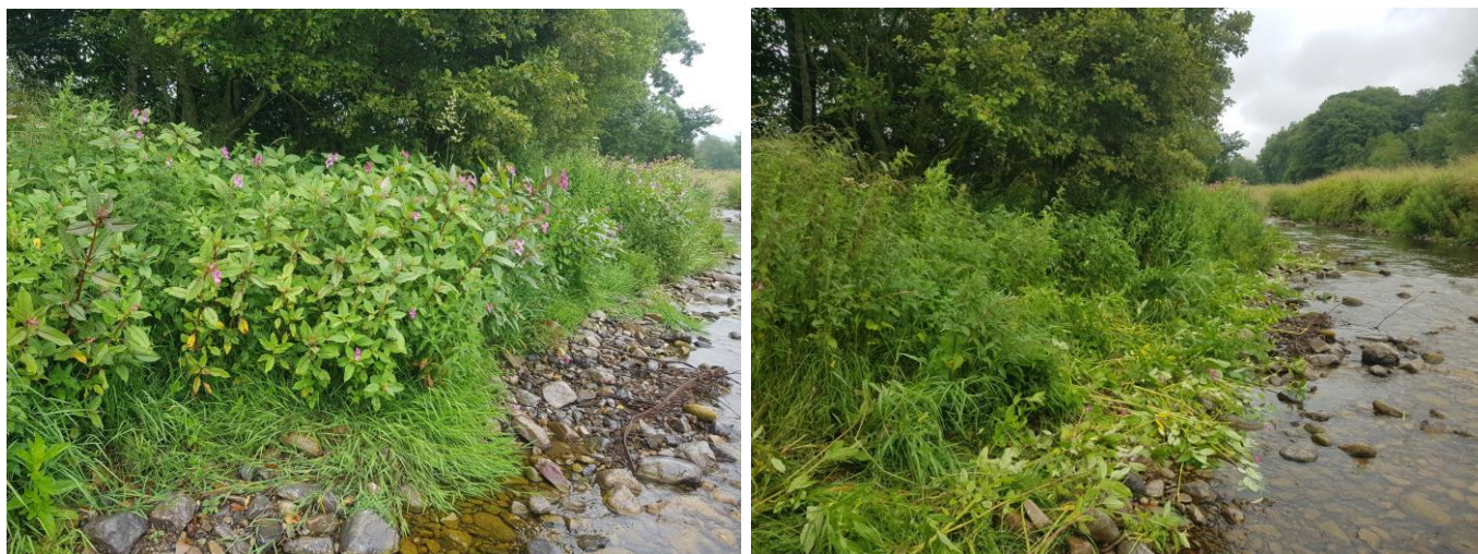
Swanside Beck before (left) and after (right) the volunteers removed the Himalayan balsam