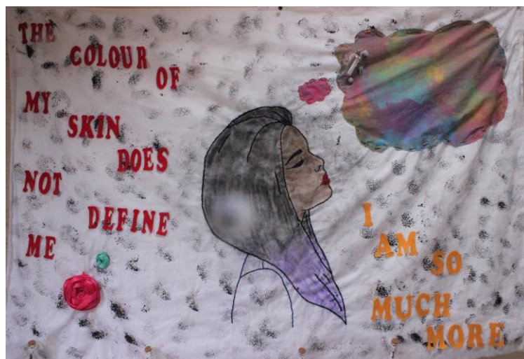
Work in progress, and a completed banner created by GCSE Textile students at Marsden Heights