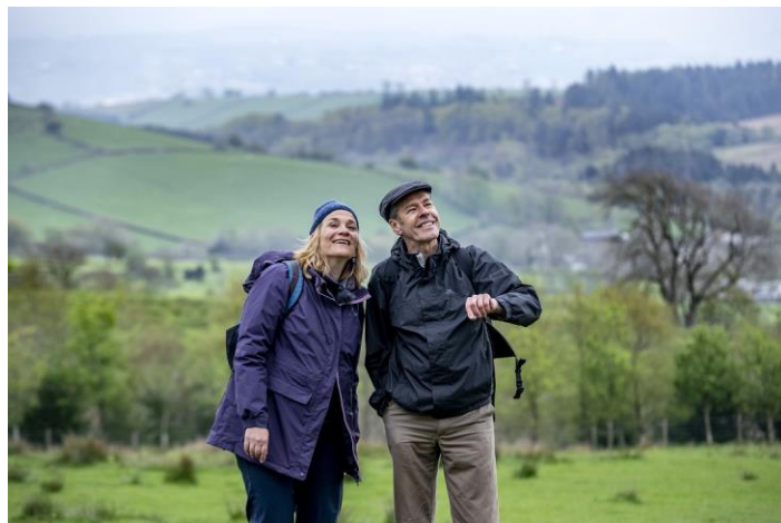
Two stills from the Tracy Chevalier visit, later featured in Lancashire Life and other local news