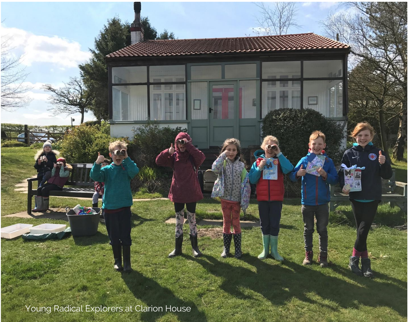
Young Radical Explorers at Clarion House