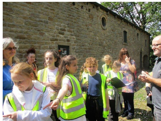
Pupils involved in developing a treasure trail for Barrowford village