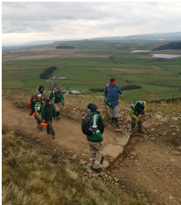
PEN activity sessions walking and working in the landscape